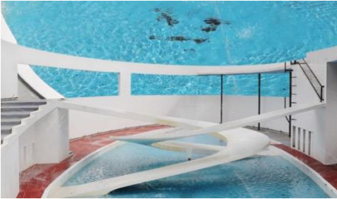
Katharina Swoboda / AT / Penguin Pool 3'20" 2015