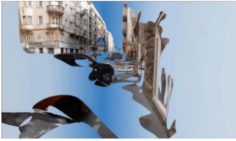
Om Bori / HU / Redundancy 2'56" 2015