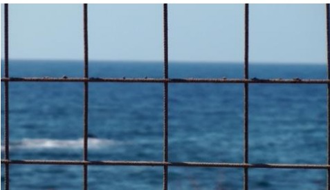
Beate Hecher / AT / & Markus Keim / IT / Mediterranean Sea 9' 2016